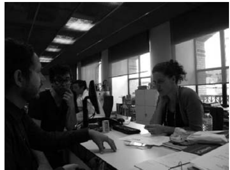
Left Fig. Lab session CA2M