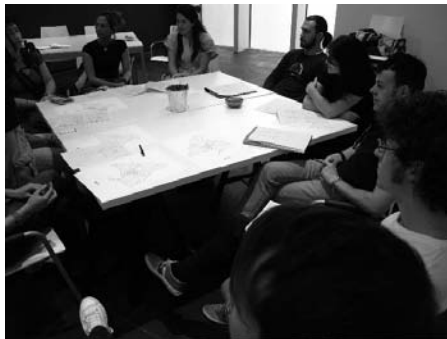
Right Fig. Presentation of results