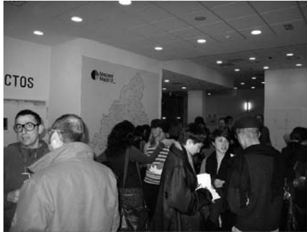
Right Fig. Work session at CA2M