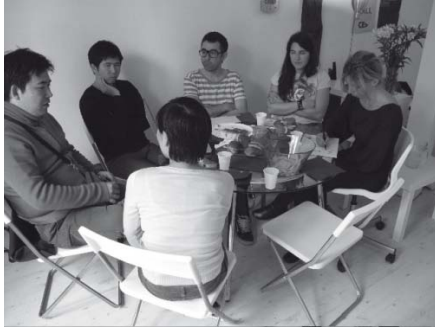
Right Fig. Workshop at CA2M